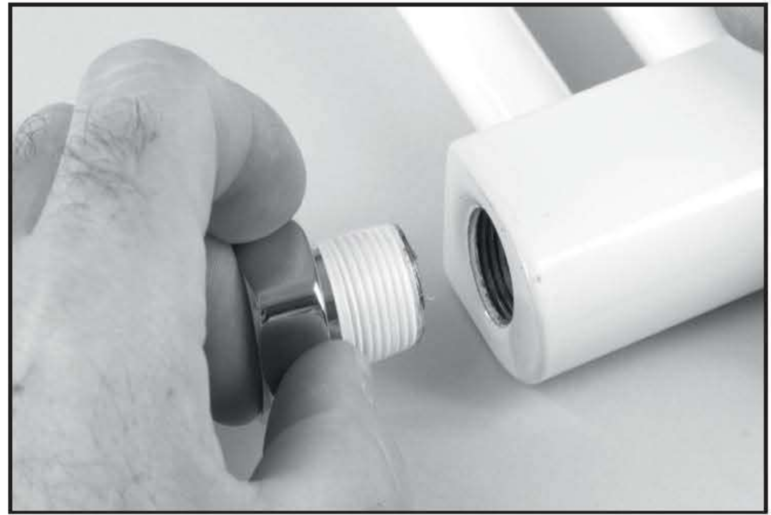
2. Screw the threaded end into the radiator or towel rail