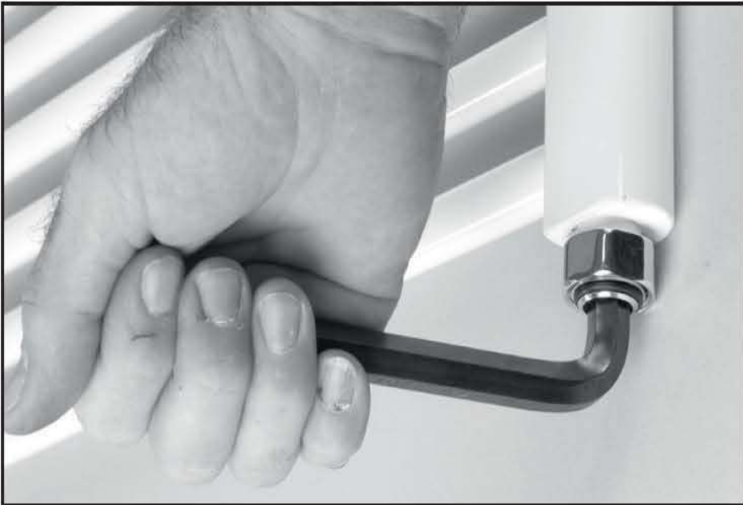
3. Tighten using an appropriate tool