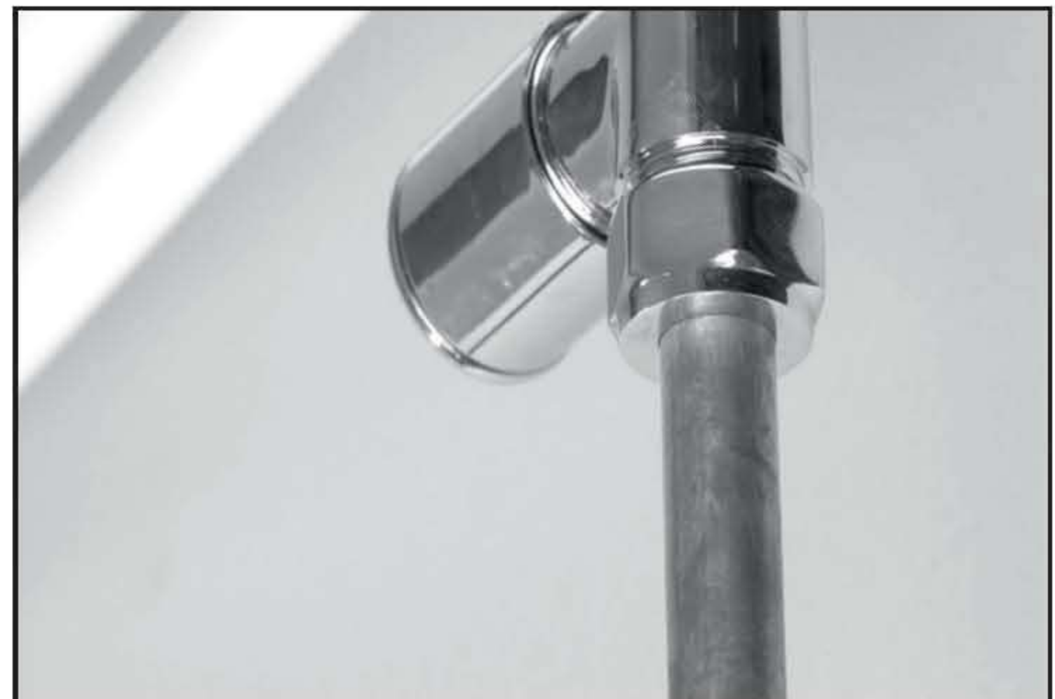
6. Insert pipe.