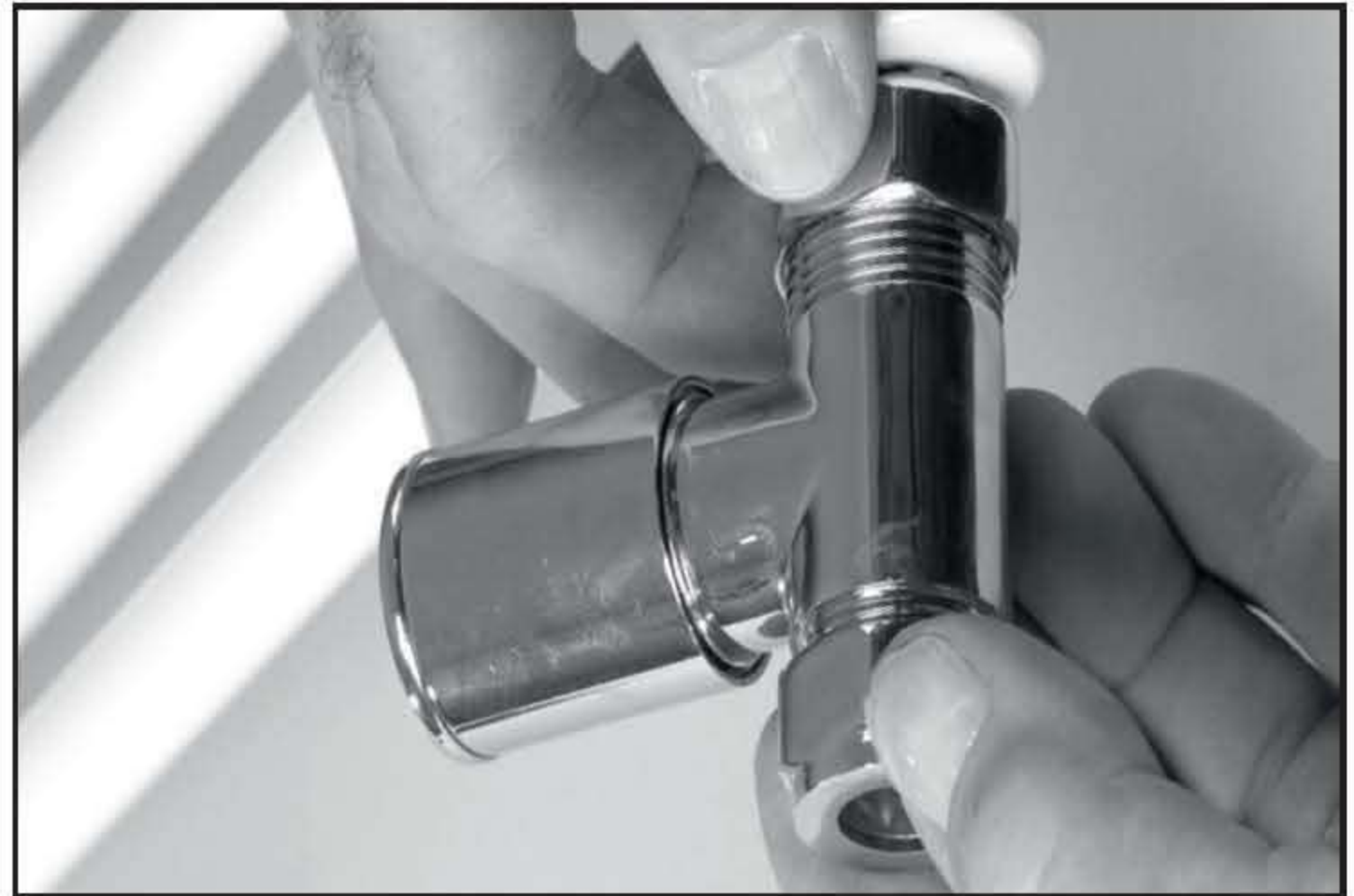
4. Attach valve and turn finger tight in to the correct position