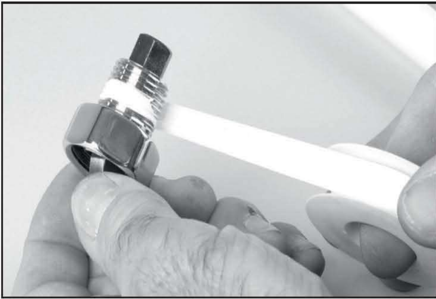
1. Wrap PTFE tape clockwise around the tail thread