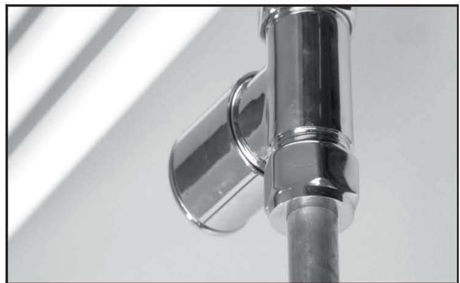
8. Run the central heating to the radiator