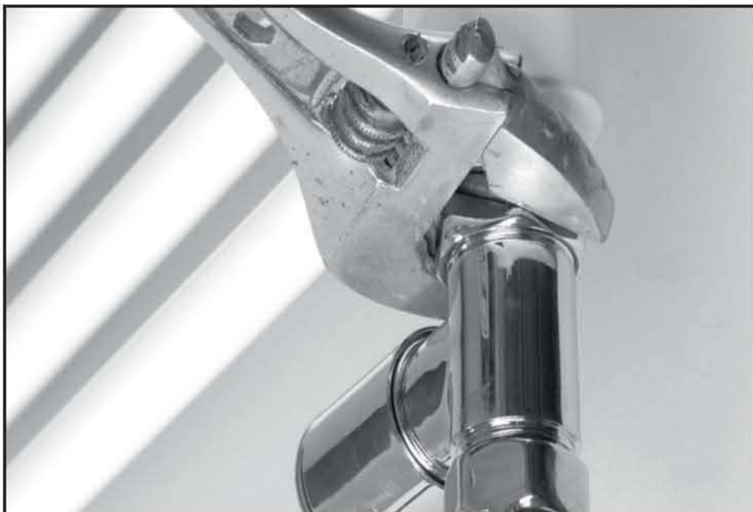
5. Fully tighten the valve using an appropriate tool