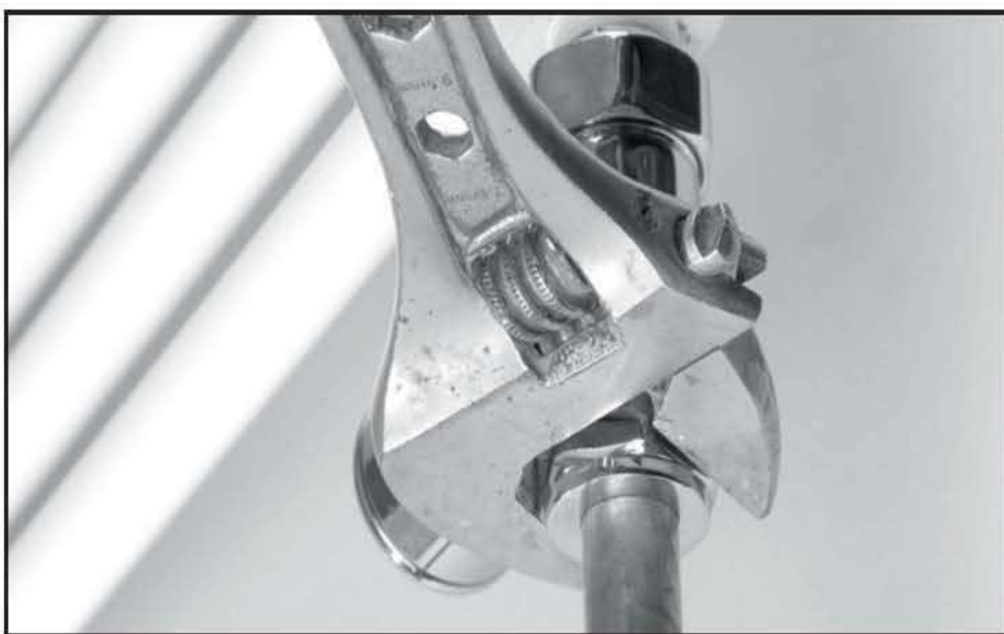
7. Tighten the the nut that holds the pipe in position