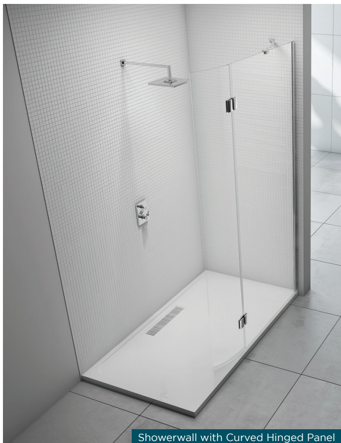
Showerwall with Curved Hinged Panel