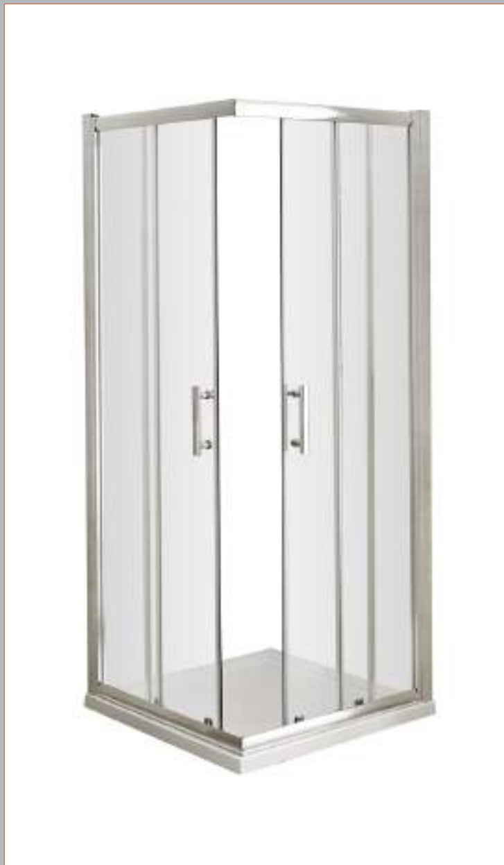
Pacific Corner Entry Enclosure

Description: Aegean Corner Entry Enclosure 800X800mm