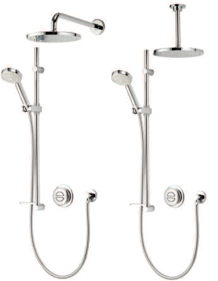
Quartz Digital concealed with adjustable and wall mount fixed head