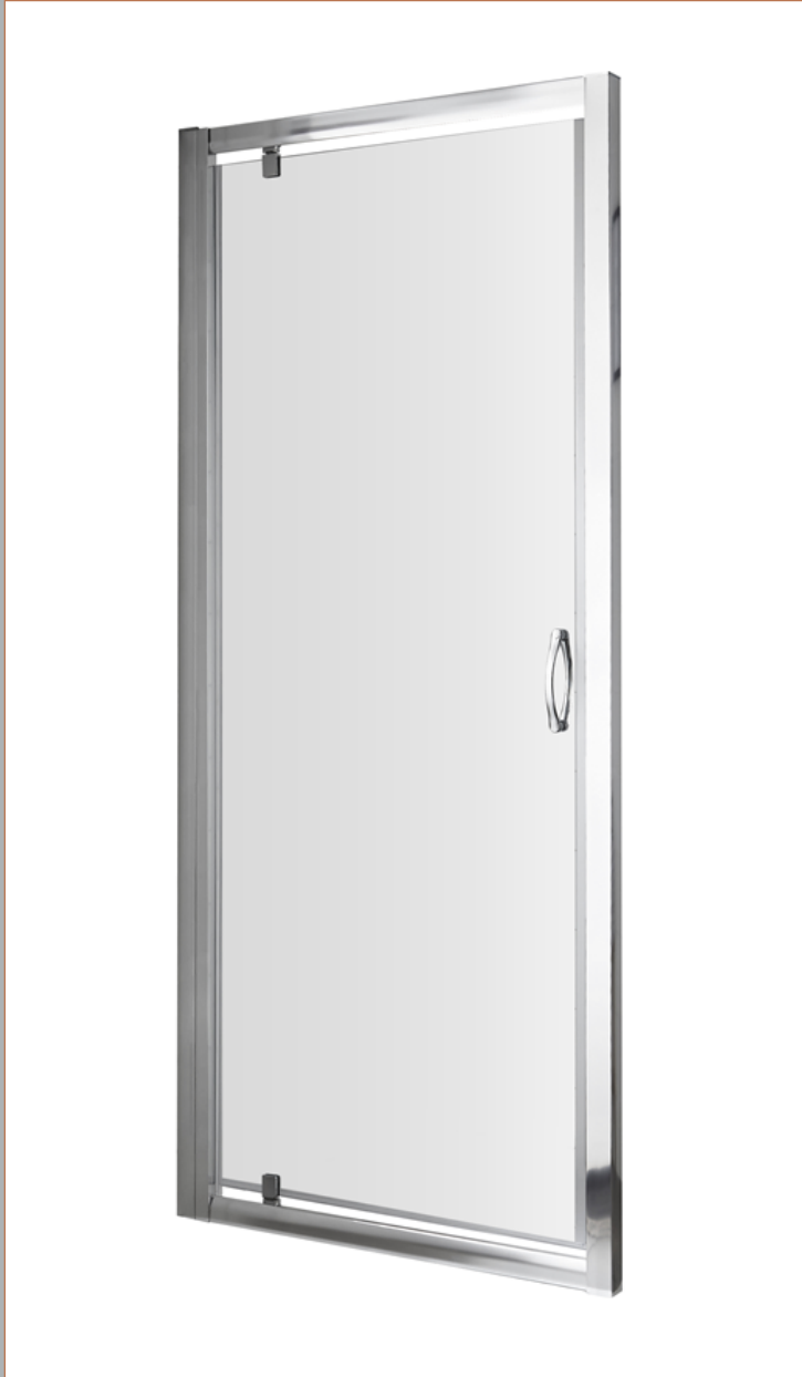
Ella Pivot Enclosure

Description: Ella 900mm Pivot Door (1850mm)