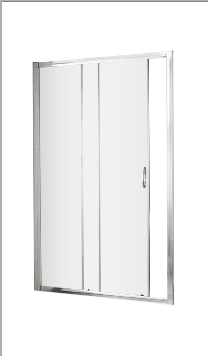
Ella Slider Enclosure

Description: Ella 1000mm Sliding Door (1850mm)