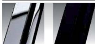
Chrome code K