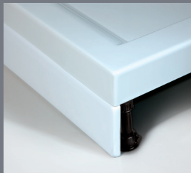
Adjustable legs & tray panel kit