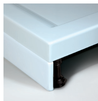
Adjustable legs & tray panel kit