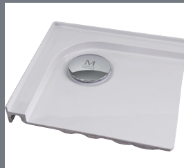
90mm branded fast flow waste available