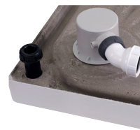
Graduated adjustable leg system