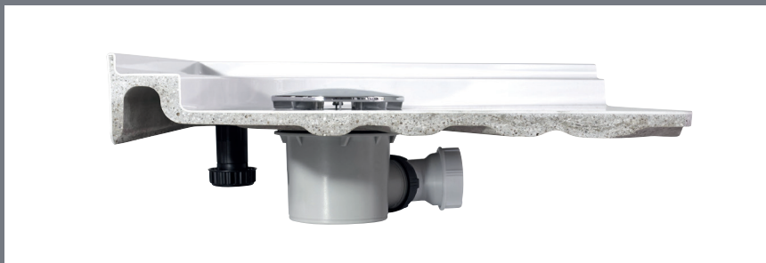
Merlyn Upstand Tray cross-section with upstand - tray is 63mm high including upstand