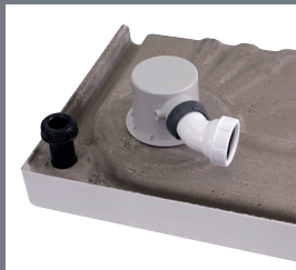
Graduated adjustable leg system