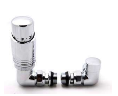
MODAL TRV Corner Chrome Valve