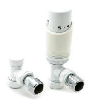
MODAL TRV Angled White Valve