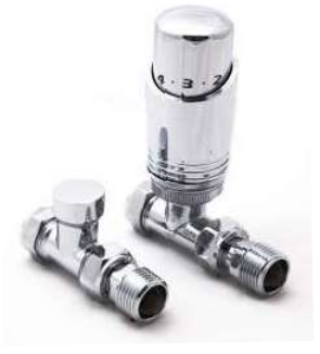
MODAL TRV Straight Chrome Valve