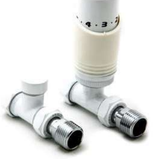
MODAL TRV Straight White Valve