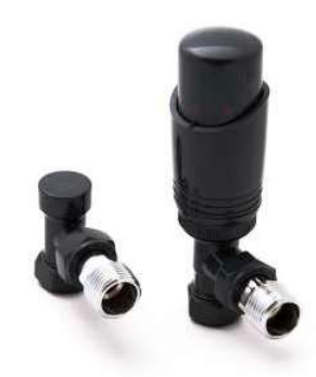
MODAL TRV Angled Anthracite Valve