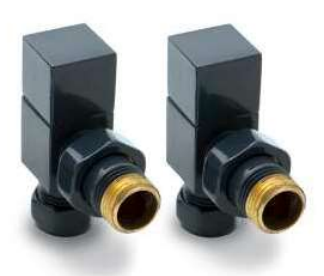
LOGE Angled Anthracite Valve