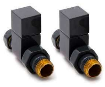
LOGE Straight Anthracite Valve