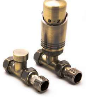
MODAL TRV Straight Bronze Valve