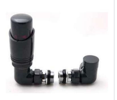
MODAL TRV Corner Anthracite Valve