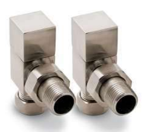
LOGE Angled Brushed Valve