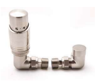
MODAL TRV Corner Brushed Valve