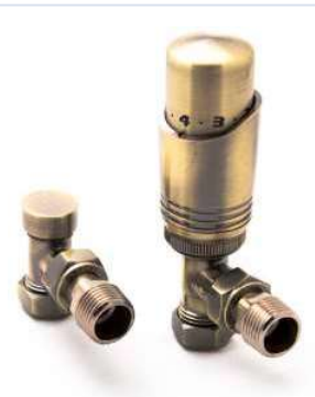
MODAL TRV Angled Bronze Valve