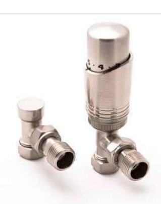
MODAL TRV Angled Brushed Valve