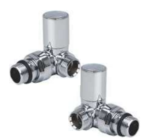
Crova Chrome Corner Valve