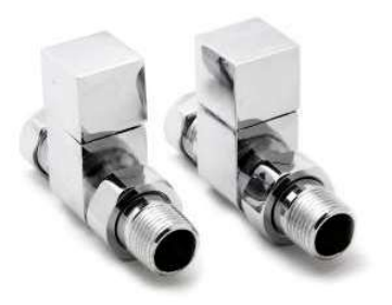
LOGE Straight Chrome Valve