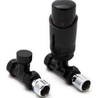
MODAL TRV Straight Black Valve