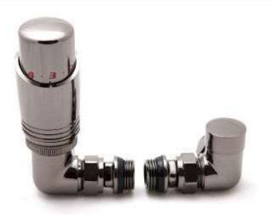
MODAL TRV Corner Oiled Bronze Valve