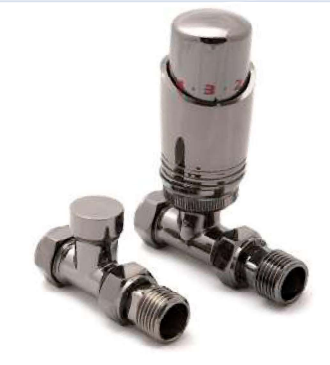
MODAL TRV Straight Oiled Bronze Valve