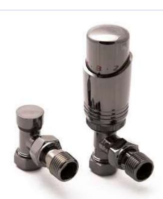
MODAL TRV Angled Oiled Bronze Valve