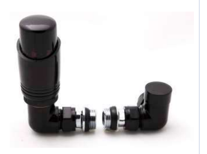
MODAL TRV Corner Black Valve