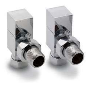
LOGE Angled Chrome Valve