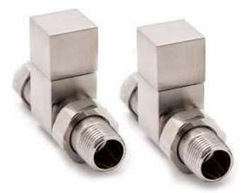
LOGE Straight Brushed Valve