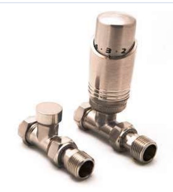
MODAL TRV Straight Brushed Valve