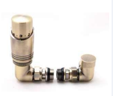
MODAL TRV Corner Bronze Valve