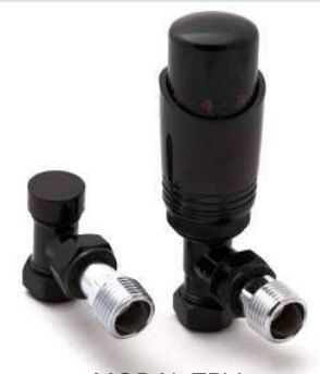
MODAL TRV Angled Black Valve