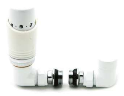
MODAL TRV Corner White Valve