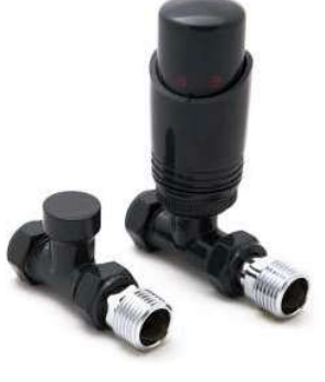
MODAL TRV Straight Anthracite Valve