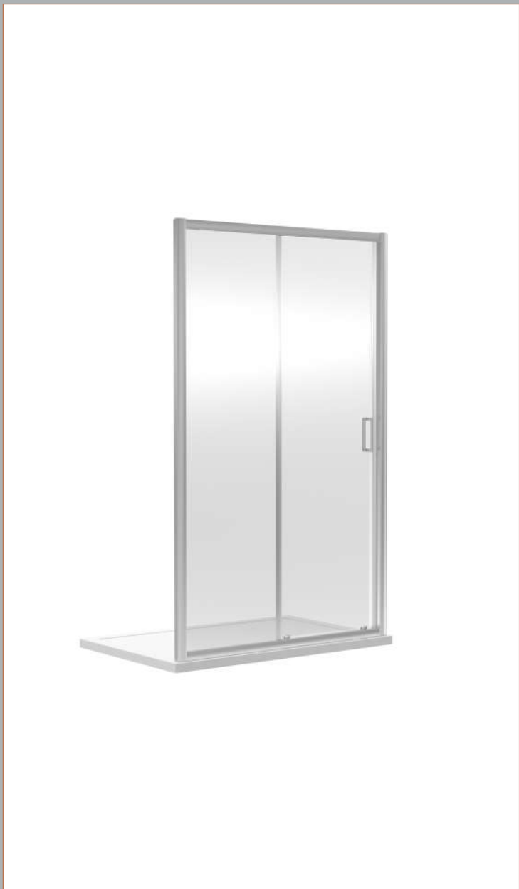
SQ Slider Enclosure

Description: 1000X1850mm Sliding Shower Door