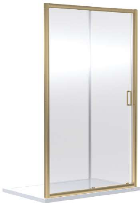
SQ Slider Enclosure

Description: 1200X1850mm Sliding Shower Door