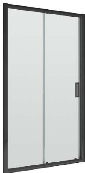
SQ Slider Enclosure

Description: 1200X1850mm Sliding Shower Door