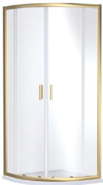
SQ Quadrant Enclosure

Description: 900X900x1850mm Quadrant Enclosure