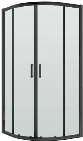
SQ Quadrant Enclosure

Description: 900X900x1850mm Quadrant Enclosure