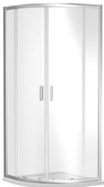
SQ Quadrant Enclosure

Description: 900X900x1850mm Quadrant Enclosure