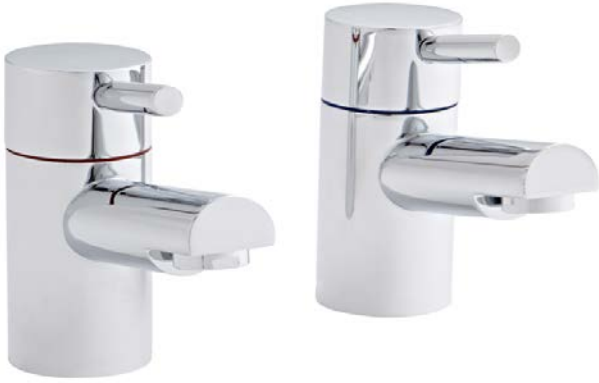
ILLUSTRATION: PLAN BATH PILLAR TAPS