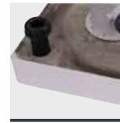
Graduated adjustable leg system