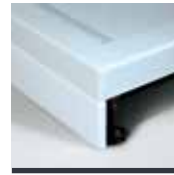
Adjustable legs & tray panel kit