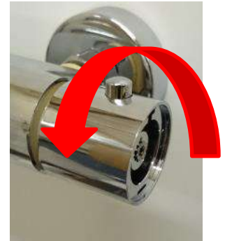
6. If the pre-set temperature is too cold, turn the handle towards the hot and wait approx. 10 seconds.