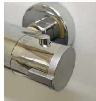
9. Re-fit the Temperature Handle Concealing Cap.