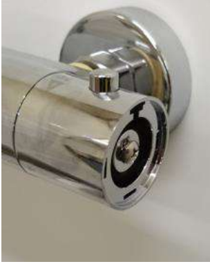
1. Remove the Temperature Handle Concealing Cap.

Note: The Temperature handle fixing method will slightly vary depending on type.