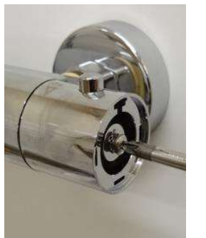
8. Again using a X-head screwdriver secure the Temperature Handle.