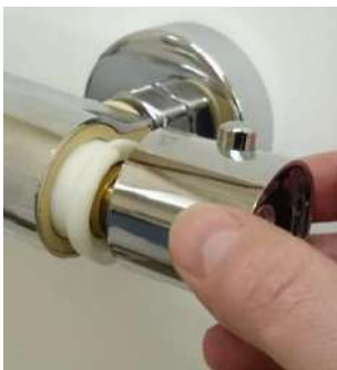
7. Once the Shower is set to the desired temperature, relocate the Temperature Handle onto the Cartridge spline, ensuring that the Over-ride Button Pin is against the Temperature Stop Lug. (This prevents the temperature from exceeding 38°C unless the Over-ride button is pressed)