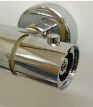
4. Relocate the Temperature Handle back onto the Cartridge Spline by approx. 3mm.