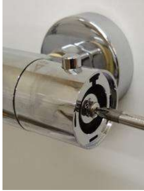
2. Using a X-head screwdriver remove the Temperature Handle.