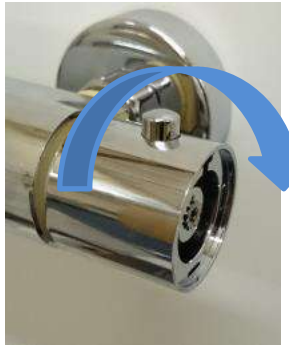
5. If the pre-set temperature is too hot, turn the handle towards the cold and wait approx. 10 seconds.