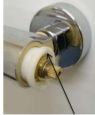
3. The Temperature Stop Lug and Cartridge Spline are now visible.